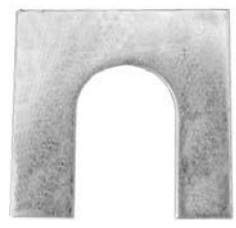
Caster and Camber and Ball Joints Ford