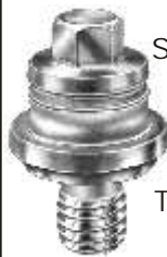
Zinc Plated Battery Side Terminal Bolt