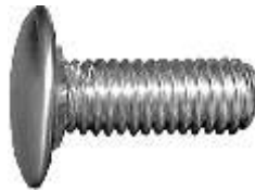
11614 (9433489) Zinc

3/8"-16 x 1" Stainless Steel Capped Pan Head w/o Nuts Head Diameter: 7/8" Shoulder Length: 3/32" GM