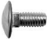
9853 (376337-S100) Zinc

5/16"-18 x 3/4" Stainless Steel Cap w/o Nuts Head Diameter: 3/4" Shoulder Length: 3/16" Ford