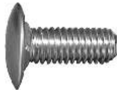
10655 (6026723) Zinc

3/8"-16 x 1" Stainless Steel Capped Pan Head w/o Nuts Head Dia: 7/8" Shoulder Length: 3/32" Chrysler