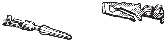
No. 6178 “Fix-Kit” O.E.M. Electrical Terminals & Tools GM, Ford & Chrysler 24 Varieties - 149 Pieces

Contains the following Auveco Part Numbers: 8774, 8776, 11947, 11948, 14153, 14154, 14462, 14880, 14881, 14882, 14883, 14884, 14885, 14887, 14888, 14889, 14892, 14893, 14894, 15497, 15498, 15499, 15504 & 16004