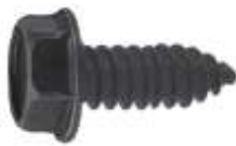
12350 (11500086) Phosphate

M8-2.12 x 20mm (5/16"-12 x 25/32") Hex Washer Head 16mm (5/8") Washer Hd. O.D. 13mm Hex GM