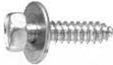
12352 (11504515) Zinc

M6.3-1.81 x 25mm (#14 x 1") Hex Head Sems® 17mm (21/32") Washer O.D. 10mm Hex GM