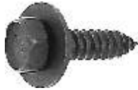
12339 (11500996, 11505023) Phosphate

M6.3-1.81 x 25mm (#14 x 1") Hex Head Sems® 17mm (21/32") Wshr O.D. 10mm Hex GM