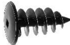
20970 Not Available From O.E.M. Black Nylon

M14 x 34mm Bumper and Door Insulator Nylon Screw 22mm Head O.D. No. 3 Square Drive Fits Into 12mm Hole GM, Ford & Chrysler 2005 - On