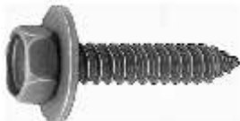
12354 (11500997) Phosphate

M6.3-1.81 x 30mm (#14 x 1-3/16") Hex Head Sems® 17mm (21/32") Washer O.D. 10mm Hex GM