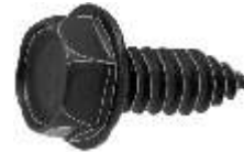
10364 Black Oxide

5/16"-12 x 7/8" Hex Washer Head 21/32" Washer Head O.D. 1/2" Hex