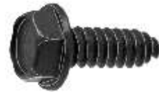
10714 (9796223) Phosphate

5/16"-12 x 1" Hex Washer Head 21/32" Washer Head O.D. 1/2" Hex GM