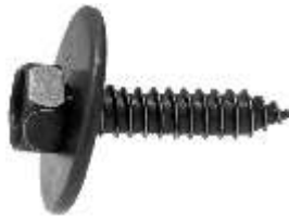
12068 (11504981) Phosphate

M6.3-1.81 x 30mm (#14 x 1-3/16") Hex Head Sems® 24mm(15/16") Washer O.D. 10mm Hex GM