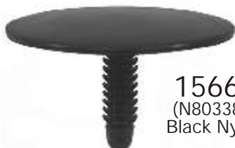
15668 (N803387) Black Nylon Trim Panel Retainer Ford UNIT PACKAGE: 25