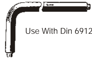
Use With Din 6912