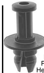
20967 (Not Available From O.E.M.) Black Nylon

Please E-mail Your New Item Suggestions To Mail@auveco.com