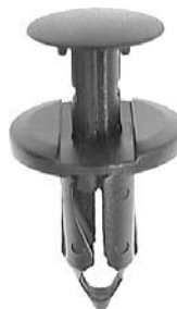
17216 (GM: 21030249; Ford: N807389S; Chry: 6503598) Black Nylon

Air Baffle To Under Carriage Push-Type Retainer Head Diameter: 20mm Stem Length: 20mm Fits Into 8mm Hole