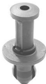
20766 (6507669-AA) Black Nylon

Radiator Grille Push-Type Retainer Head Diameter: 20mm Stem Length: 16mm Fits Into 10mm Hole Dodge Durango 2004 - On