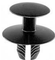
21086 (Mercedes-Benz: 230-990-01-92; Chrys: 6104900-A) Black Nylon

Hood Insulation & Cowl Grille Push-Type Retainer Head Diameter: 20mm Stem Length: 10mm Fits Into 8mm Hole Mercedes GL, M, R, SL & SLK 2005 - On Chrysler 2010 - On