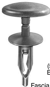
19245 (5BB14LX9) Black Nylon

Fascia To Front Bumper Push-Type Retainer Large Head Dia.: 3/4" Stem Length: 1-1/8" Fits Into 1/4" Hole Dodge Dakota 1994-On