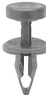
20457 (4857345-AA) Black Nylon

Tail Light Housing Push-Type Retainer Large Head Dia.: 21mm Stem Length: 23mm Fits Into 9.5mm Hole Caravan Town & Country And Voyager Mini Vans 2002 - On