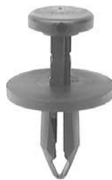
20458 (6506132-AA) Black Nylon

Side Radiator Shield Push-Type Retainer Head Dia.: 20mm Stem Length: 17mm Fits Into 7mm Hole Sebring & Stratus 2001 - On