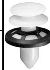
21601 (06509673AA) White & Black Nylon

Push-Type Retainer With Sealer Top Head Diameter: 16mm Middle Head Diameter: 18mm Bottom Head Diameter: 22mm Stem Length: 16mm Fits Into 9mm Hole Chrysler 300 & Magnum and Jeep Grand Cherokee & Wrangler 2011 - On