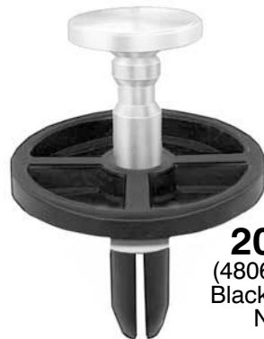
20963 (4806334-AA) Black & White Nylon

Rear Bumper Push-Type Retainer With Sealer Head Diameter: 34mm Shoulder Length: 3.5mm Stem Length: 17mm Fits Into 8.5mm Hole Dodge Caliber and Jeep Compass & Patriot 2007 - On