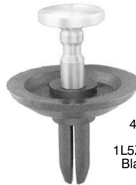
19638 (Chrys: 4805405AA; Ford: 1L5Z-17K826AA) Black & White Nylon

Front Bumper Fascia Push-Type Retainer Head Dia.: 34mm Stem Length: 20mm Fits Into 8mm Hole Concorde, Intrepid, Eagle Pacifica & PT Cruiser 1998-On Ford Trucks 2005-On