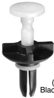
21376 (4389947-AA) Black & White Nylon

Bumper Cover Push-Type Retainer With Sealer Head Diameter: 24mm Shoulder Length: 3mm Stem Length: 20mm Fits Into 11mm Hole Avenger, Journey & Sebring 2008 - On