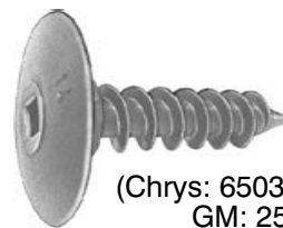
19417 (Chrys: 6503819, 6503401; GM: 25631448) Black Nylon

M7.5 x 35mm Square Drive Truss Head 22mm Head Diameter 9mm Shoulder Diameter Foam To Bumper Fascia Chrysler 1993 - On GM 1997 - On