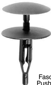
18394 (6503453) Black Nylon

Fascia To Bumper Push-Type Retainer Large Head Dia.: 1" Stem Length: 1-1/8" Fits Into 1/4" Hole Jeep Grand Cherokee 1994 - On