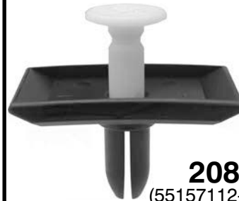
20890 (55157112-AA, -AB) Black & Natural Nylon

Bumper Cover Push-Type Retainer Head Size: 25mm x 45mm Shoulder Length: 3mm Stem Length: 20mm Fits Into 9.5mm Hole Jeep Liberty 2005 - On