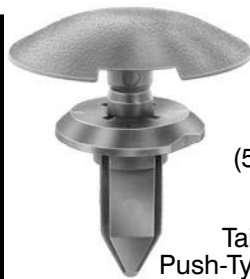
20940 (55157330-AC) Black Nylon

Tail Light Push-Type Retainer Large Head Diameter: 31mm Small Head Diameter: 20mm Stem Length: 21mm Fits Into 8mm Square Hole Jeep Commander 2006 - On