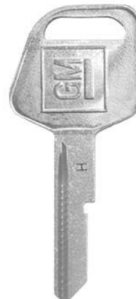
20008 (Strat: 321951) "W" Bodies 1991-On U.P. 15