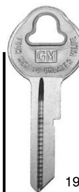
19929 (Strat: 32319) 1966-36 U.P. 10