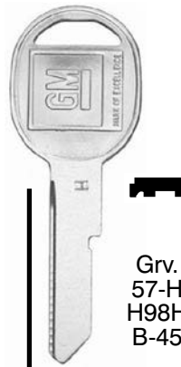
19945 (Strat: 320405) U.P. 25