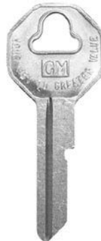
19928 (Strat: 32318) 1966-36 U.P. 10