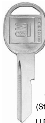
19955 (Strat: 320589) U.P. 25