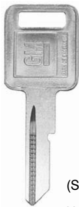
19954 (Strat: 320588) U.P. 25