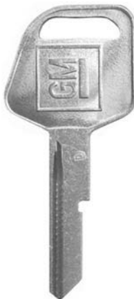
19982 (Strat: 321622) "W" Bodies 1990-88 U.P. 10