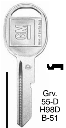
19958 (Strat: 320653) U.P. 25