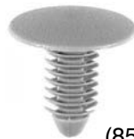
21349 (85746-06000LX) Gray Nylon

Headliner Retainer Head Diameter: 18mm Stem Diameter: 8mm Stem Length: 16mm Rio 2010 - On