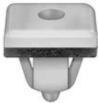
21066 (87758-37000) White Nylon

Fender & Rocker Moulding Nylon Nut With Sealer M4.2 (#8) Screw Size Head Size: 17mm x 17mm Stem Length: 14mm Hyundai 1999 - On Kia Optima & Sorrento 2001 - On