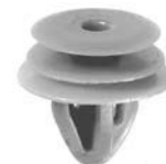
21188 (82315-27000) Pink Nylon

Trim Panel Retainer Top Head Diameter: 15mm Middle Head Diameter: 16mm Bottom Head Diameter: 18mm Stem Diameter: 10mm Stem Length: 12mm Hyundai & Kia 2003 - On