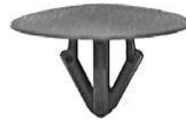
20543 (81126-37010) Black Nylon

Hood Insulation Retainer Head Diameter: 26mm Stem Diameter: 12mm Stem Length: 14mm Hyundai Elantra & Sonata And Kia Optima 1995 - On