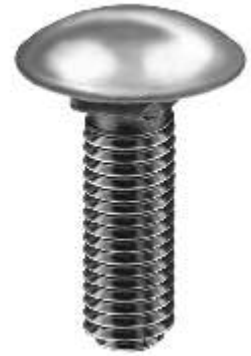
17187 (N800883-S100) Black Phosphate

M12-1.75 x 40mm Stainless Steel Cap w/o Nuts Sealing Patch On Threads Head Diameter: 28mm Shoulder Length: 5mm Ford Truck F 150/350 & U 150 1992-80