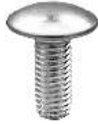
12659 (11502479, 11502480, 12338141) Zinc

M8-1.25 x 20mm Stainless Steel Capped Pan Head w/o Nuts Head Diameter: 19mm Shoulder Length: 2mm GM