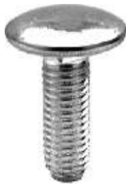
16986 (14003784) Zinc

M8-1.25 x 25mm Stainless Steel Capped Pan Head w/o Nuts Head Diameter: 19mm Shoulder Length: 3mm GM