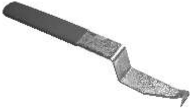
20824 Left Hand

Tools used to remove windshield reveal moulding from retaining clips on GM vehicles with rubberless installations.