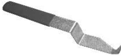
7731 Right Hand