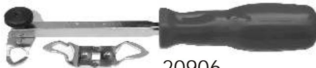
20906 Windshield Locking Strip Tool

This tool is used when replacing the windshield, rear glass or sliding rear glass on vehicles with locking strips. The unique design allows the tip to swivel 90 degrees in either direction to work where other tools can't. Just select the tip with the opening that most closely fits the locking strip and then feed the locking strip into the eyelet. Overall length: 8-1/4"