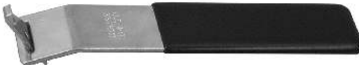
20907 Windshield Wiper Arm Remover

Makes wiper arm removal and replacement an easy job without damaging the vehicle finish. Simply place the "hook" under the arm base, lift and squeeze the wiper arm and tool handle together. The wiper arm lifts right off. Reverse the procedure to install a wiper arm. Overall length: 6-7/8"