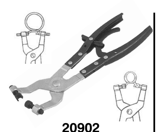
Constant Tension Band (Flat Band) Hose Clamp Pliers

Removes and installs hose clamps (Auveco part numbers 18127 - 18132) on heater and radiator hoses. Tips screw in and out to fit all sizes of clamps. Ratcheting lock mechanism holds the clamp in an open position for easy removal and installation. Tips can be switched to accommodate different applications. Offset jaws allow access to hard-to-reach areas.