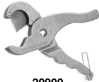
20900 Hose Cutter

Razor sharp blade cleanly cuts heater hoses, fuel line hoses and any other type of flexible hose up to 1-1/4" diameter: The stainless steel blade is reversible for double the life. The pliers are made of glass-filled gray nylon for strength. Includes a locking hoop for safe storage. Overall length: 9-1/2".