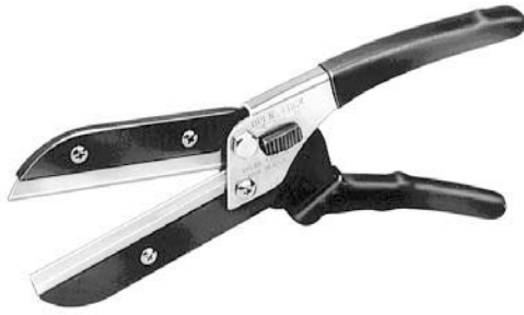
15748 Moulding Cutting Tool

A professional quality tool that cuts with absolute accuracy every time to give a clean, accurate and precise edge. The 15748 tool features a replaceable razor-sharp blade cutting against a plastic anvil which is also replaceable. Excellent for cutting rubber/plastic moulding (up to 3-1/2"), weatherstrip, carpeting and most flexible materials. The tool measures 10" overall and the handles are vinyl coated.